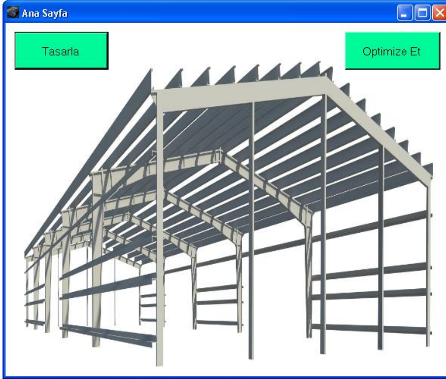
Fig. 1. Splash screen of optimum purlin design software.

clicking main page command “Ana Sayfa” that is placed under the optimize menu “Optimize Et”. Optimum design process is begun with start command “Başla”. When optimization process is finished, the passing time for optimization, beginning and finishing times, average passing time for per iteration, number of iteration until optimum result is obtained and optimum design results can be seen in “Optimum/Best Design” box (Fig. 4).